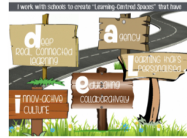
Bek Galloway is coming to Masterton in Term 3