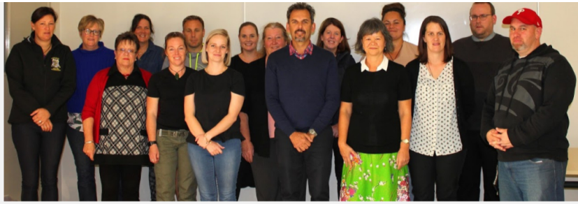
This team of amazing teachers are tasked with empowering teachers in their own schools to maximise the fantastic "gems" of education already happening in our Kāhui Ako whilst also being given time and a little resource to blaze a trail of new ideas.