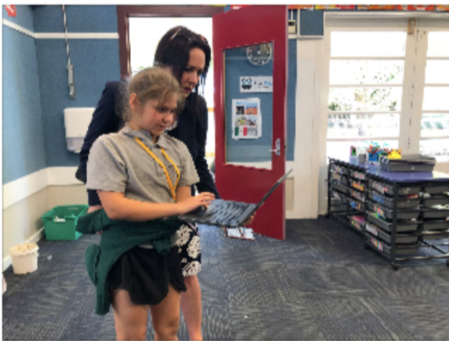
Working with pupils at Connect, Inspire, Learn