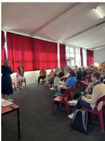
Curriculum - Teaching and Learning WSL Day

Save the date: Term 2 Teaching and Learning WSL Day – Friday, 6 June at Hadlow.