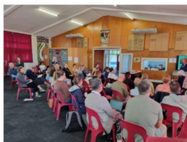
WSLs gather at Chanel College on the 7th March for a day of learning.